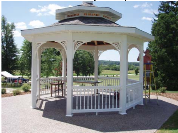
Lynn Pfister Memorial Gazebo