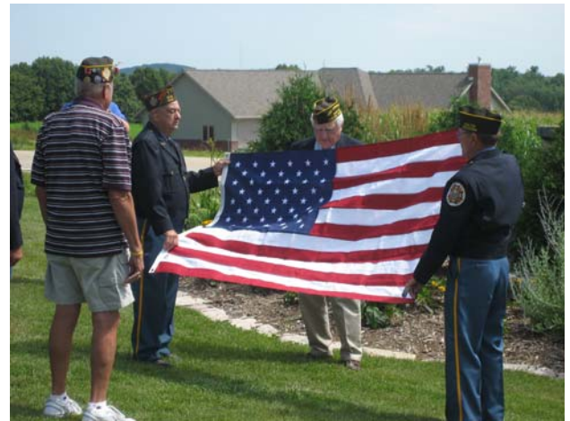
VFW Flag dedication