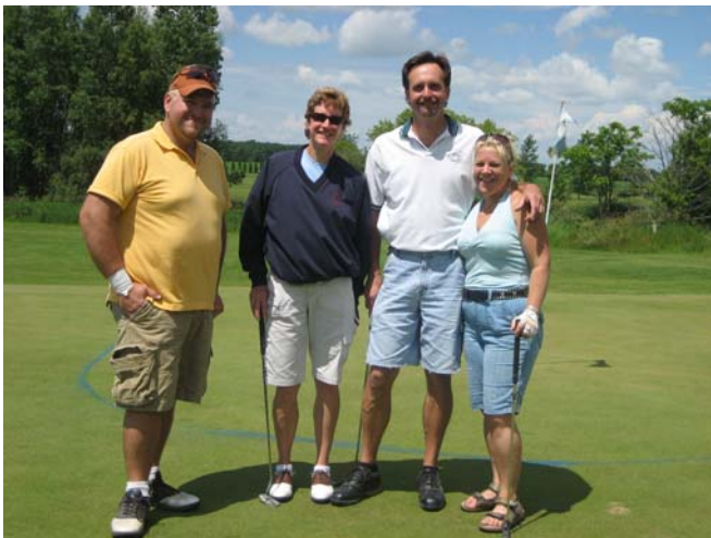
1 st place winners ~ Pla-Mor Lanes

Second Annual Golf Outing ~ We had 19 teams participate in this event on June 22nd. Thank you goes out to our hole sponsors and to all the raffle donors.