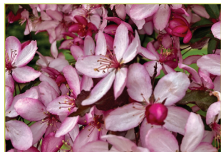
“Fabulous Buds” by Nancy Woelfel

Storage Shed Progress Report – Doors are in and we’re just waiting for some trim pieces in order to complete the siding of the front face. Lawn mowers and those that run them are grinning ear to ear :) Can’t wait to polish it up with carefree landscaping. So thankful!